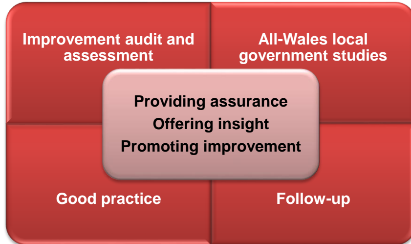
Exhibit 4: Components of my performance audit work